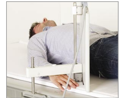
Lateral detector/cassette holder

The Intuition is highly specified in standard configuration. However, we have a range of accessories to further enhance the system to your specific needs. Examples are patient hand grip, mattress, compression belt for the table and patient arm rest for the wall stand.