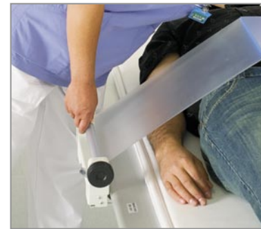
Cost effective compression belt