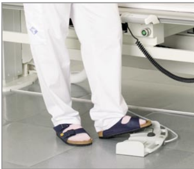
Table foot control